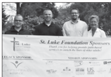
Legacy Sponsor - Crossroads Hospice You bring a smile to our faces, too!

It's typically a bad sign when your day begins with a half dozen calls asking if the golf outing has been cancelled. The forecast looked less than desirable for spending the day on the greens but we went for it! We had a break in the clouds after the first few damp holes and a beautiful day for the remainder of the outing benefiting residents of St. Luke Lutheran Community! 23 teams showed their commitment to supporting our mission at the 17th Annual St. Luke Foundation Benefit Golf Outing. Thank you to everyone who sponsored, played, donated a door prize or silent auction item. See all the sponsors on our website at www.StLukeLutheranCommunity.org . Together we raised over $23,000! We are grateful for your past support and look forward to having you join us again on Wednesday, June 24, 2015....rain or shine...save the date and bring a friend!