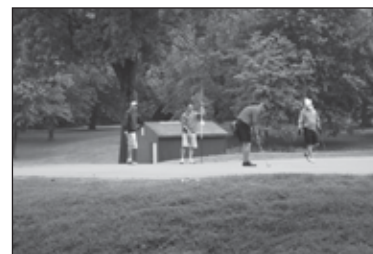
A picture-perfect putt...only these four know for sure!